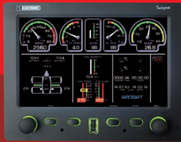
EMS TL-6724 Ready for 912iS, verified by Rotax!